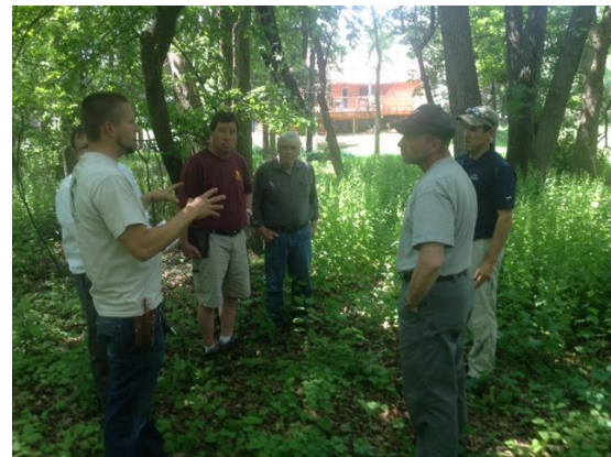
Field tour at River Bend Nature Center, grazing garlic mustard.

Other areas of interest will include demonstrating habitat improvements for pollinators, seeking nonprofit roles that can improve watershed improvement projects, and working to develop a business model template for individuals interested in starting or expanding a livestock enterprise for the purpose of grazing invasive or otherwise undesirable plants.